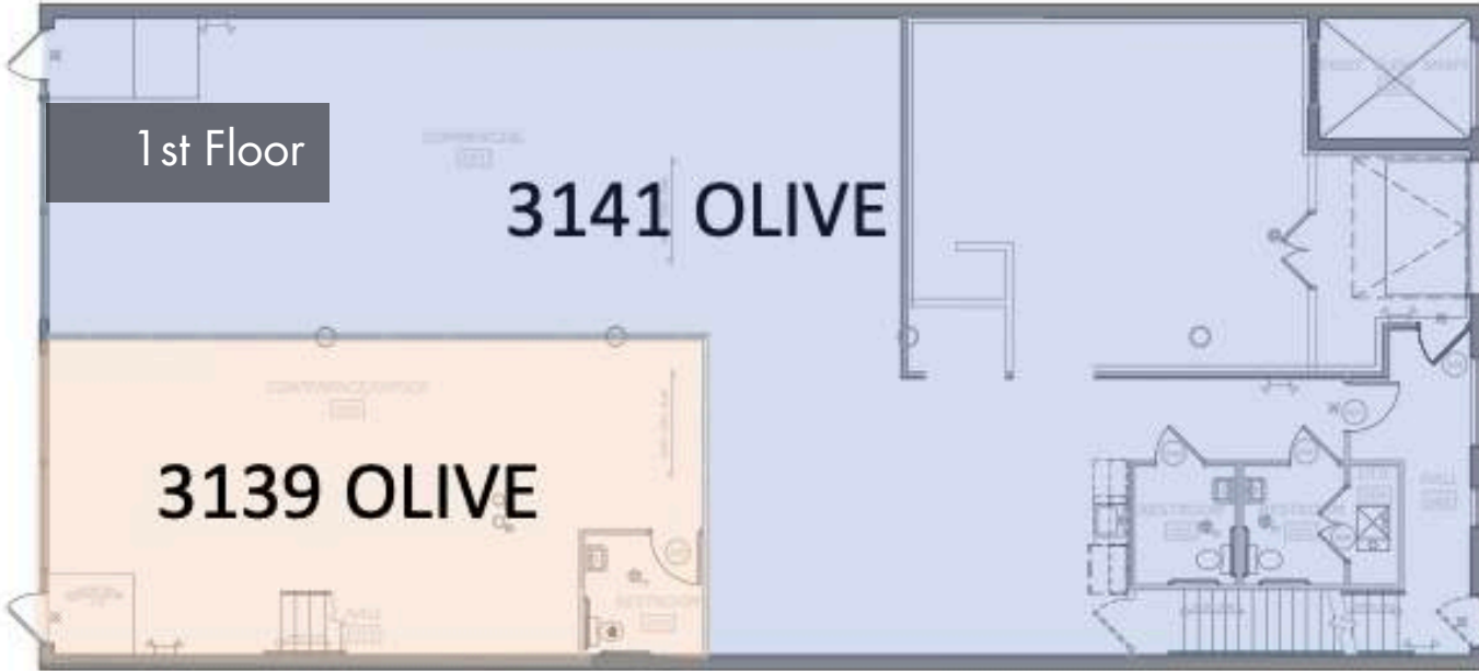
FIRST FLOOR PLAN - 3,157 main level and 833 Lower Level Sq. Ft.