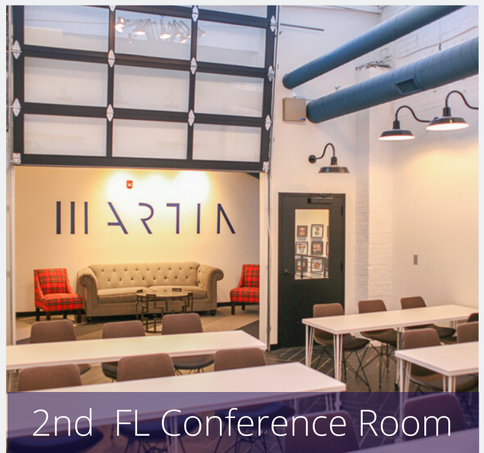
2nd FL Conference Room

2nd Floor Conference Room with Wet Bar Brainstorming & Breakout Areas Life-Sized Board Games Throughout