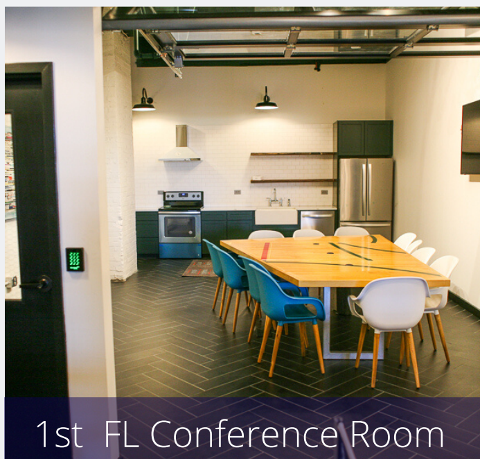
1st FL Conference Room