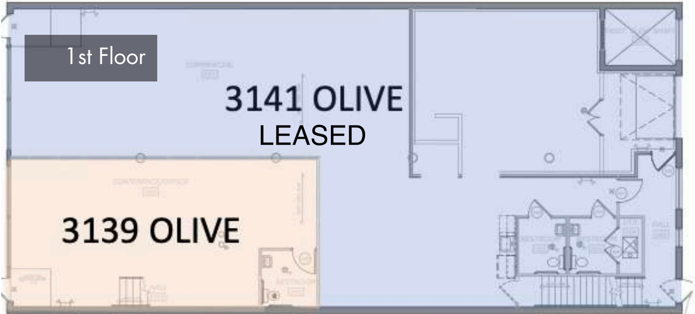
FIRST FLOOR PLAN - 3,150 main level and 830 Lower Level Sq. Ft.