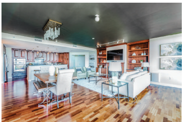
For Sale: $905,000