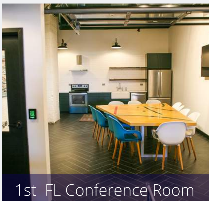
1st FL Conference Room