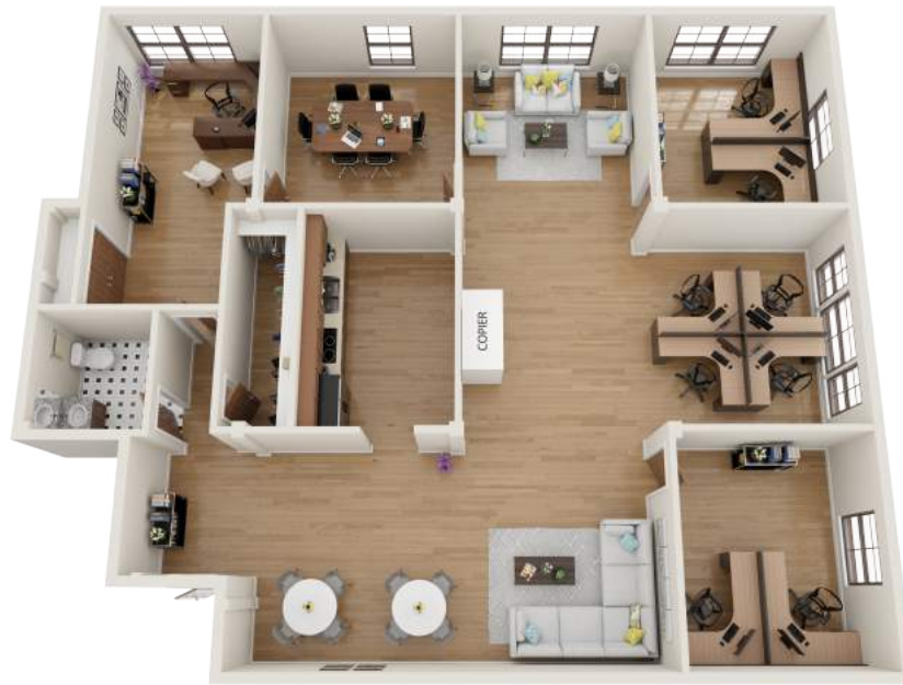
Proposed 2nd Floor 2S Layout