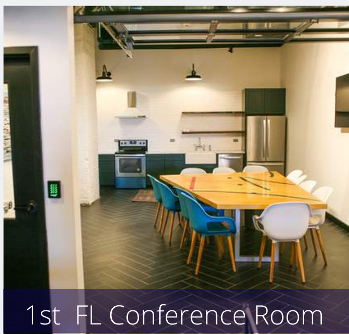
1st FL Conference Room