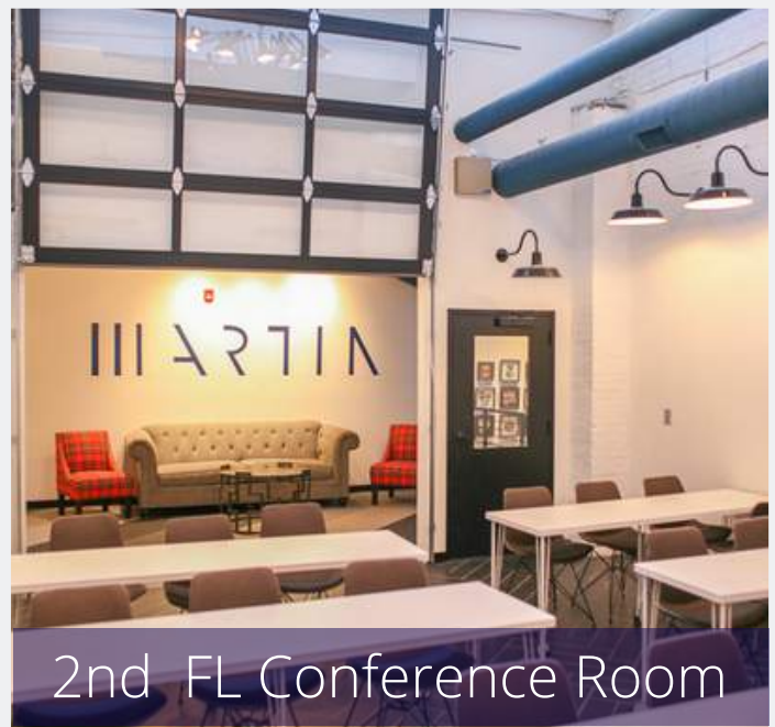
2nd FL Conference Room