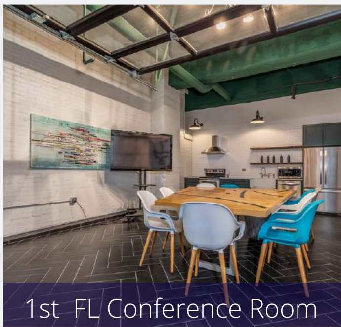
1st FL Conference Room