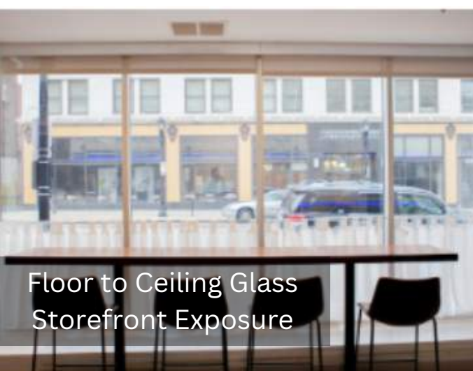
Floor to Ceiling Glass Storefront Exposure