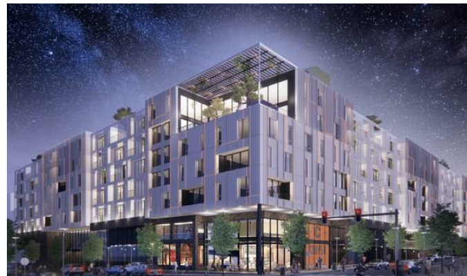
PROPOSED DEVELOPMENT RENDERING